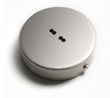
240V AC (GU10)