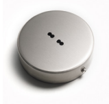
SB - Standard Base