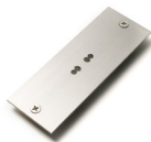
FRE - Flat Rectangular

Notes: All screws provided for installation into different materials.