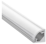
6101_NC Nano Corner