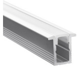
6101_NR Nano Recessed