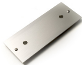
FRE - Flat Rectangular

Notes: All screws provided for installation into different materials.